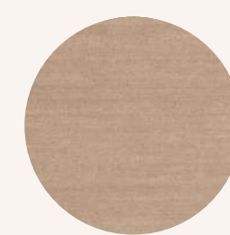
Pink Salt AZWR-PS