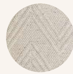
Creamy Sand AVWR-CS