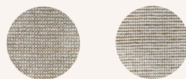
Natural/Silver AJWR-HS Natural/White AJWR-HW