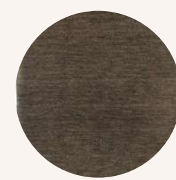
Emerald Grey AHQR-EG