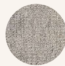
Variegated Grey AJWR-GS