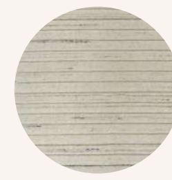
French Garlic AWBG-IV